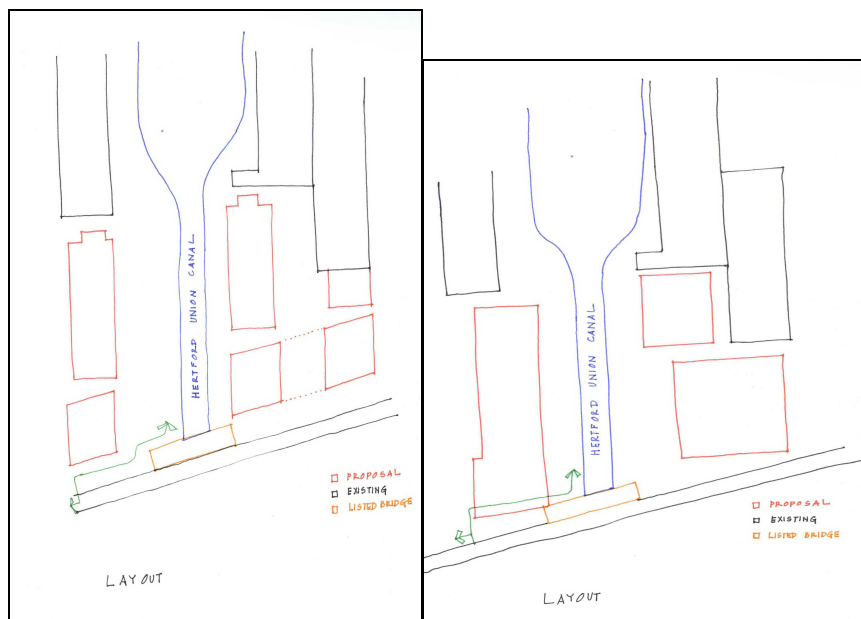
Figure 1: Indicative layout of 2002 Scheme Figure 2: Indicative layout of 2009 Scheme